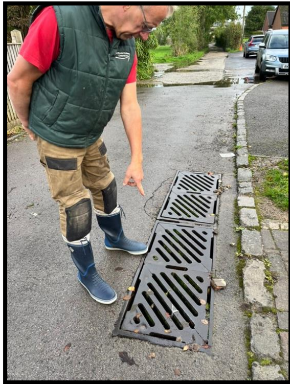
Figure 3: 4-Chamber Storm Drain