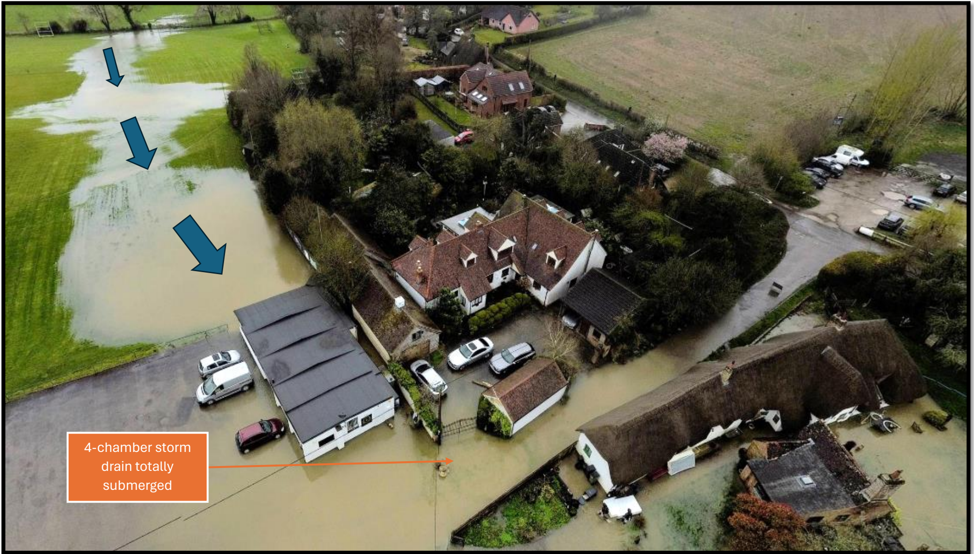
Figure 1: Frog Lane Flooding - 28 th March 2024