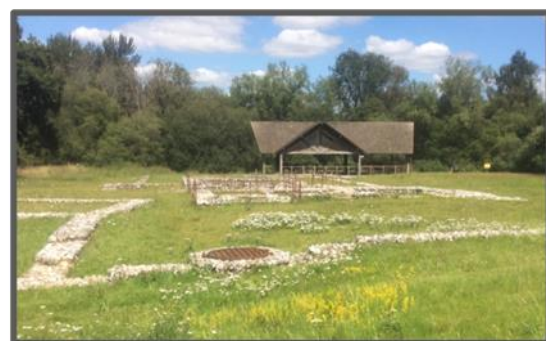
The Littlecote Roman Villa site, looking north towards the roof built over the mosaic.

If you would like further details and to sign up, please click on the link here or search www.northwessexdowns.org.uk/walking/walking-festival/